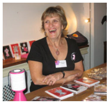
Seaton Craft Fair