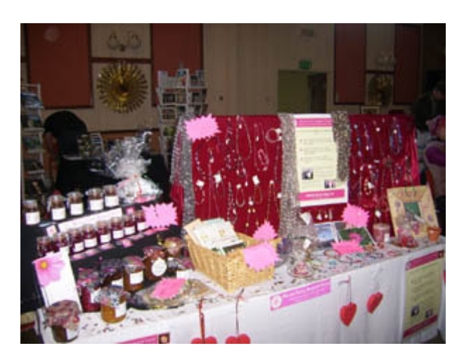
NCSF Craft Stall